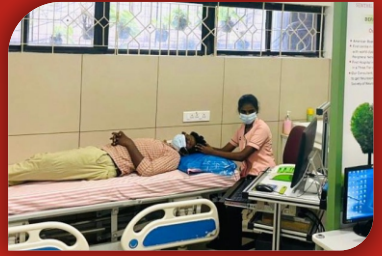
STROKE DAY CARE WARD